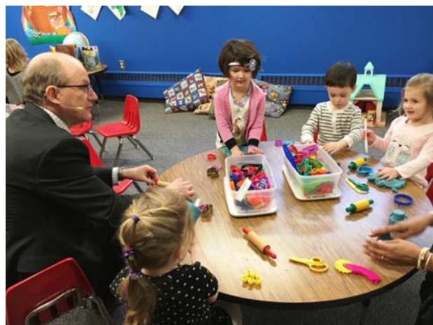
Sunday School Preschoolers

Deadline for the April 2017 Oak Leaves is - March 15 - Articles may be edited for space and/or content.