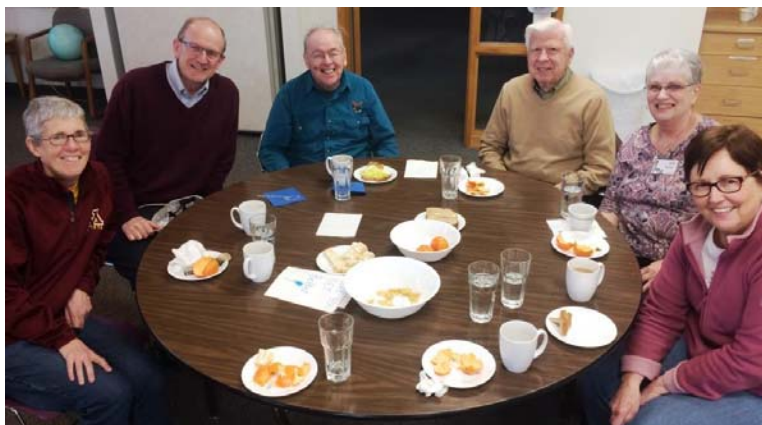
Lunch Bunch Monthly

Christmas is one of the best holiday celebrations in Guyana. Celebrating starts on Christmas morning and end the next day -- Boxing Day.