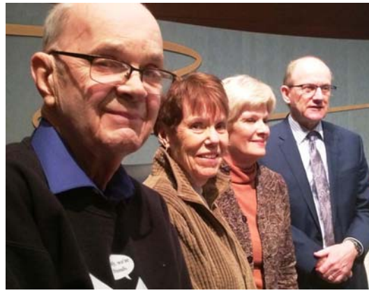
Oak Grove is honored by Bloomington Schools Homework Connection