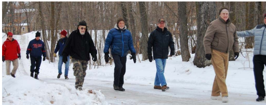
2017 Men's Retreat at Clearwater Forest