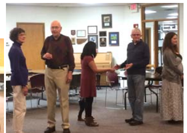
Great fun was had at the Hoedown Square Dance!